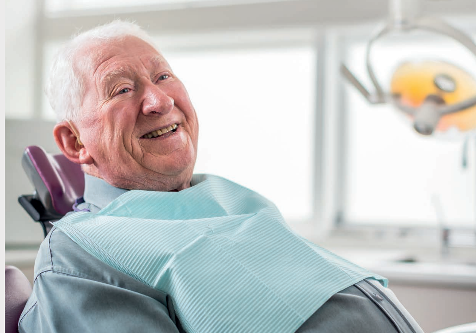
The Puckey Fund provides eligible Selwyn residents with various essentials that may be beyond their means – like free dental treatment.

In addition to helping individuals access benefits and health services, the support worker provides budgetary advice to help them manage their daily lives, and assists them in re-establishing connections in society that they have lost. By collecting outcomes data on the effectiveness of the initiative, we are able to evaluate how our support is providing help to those in need.