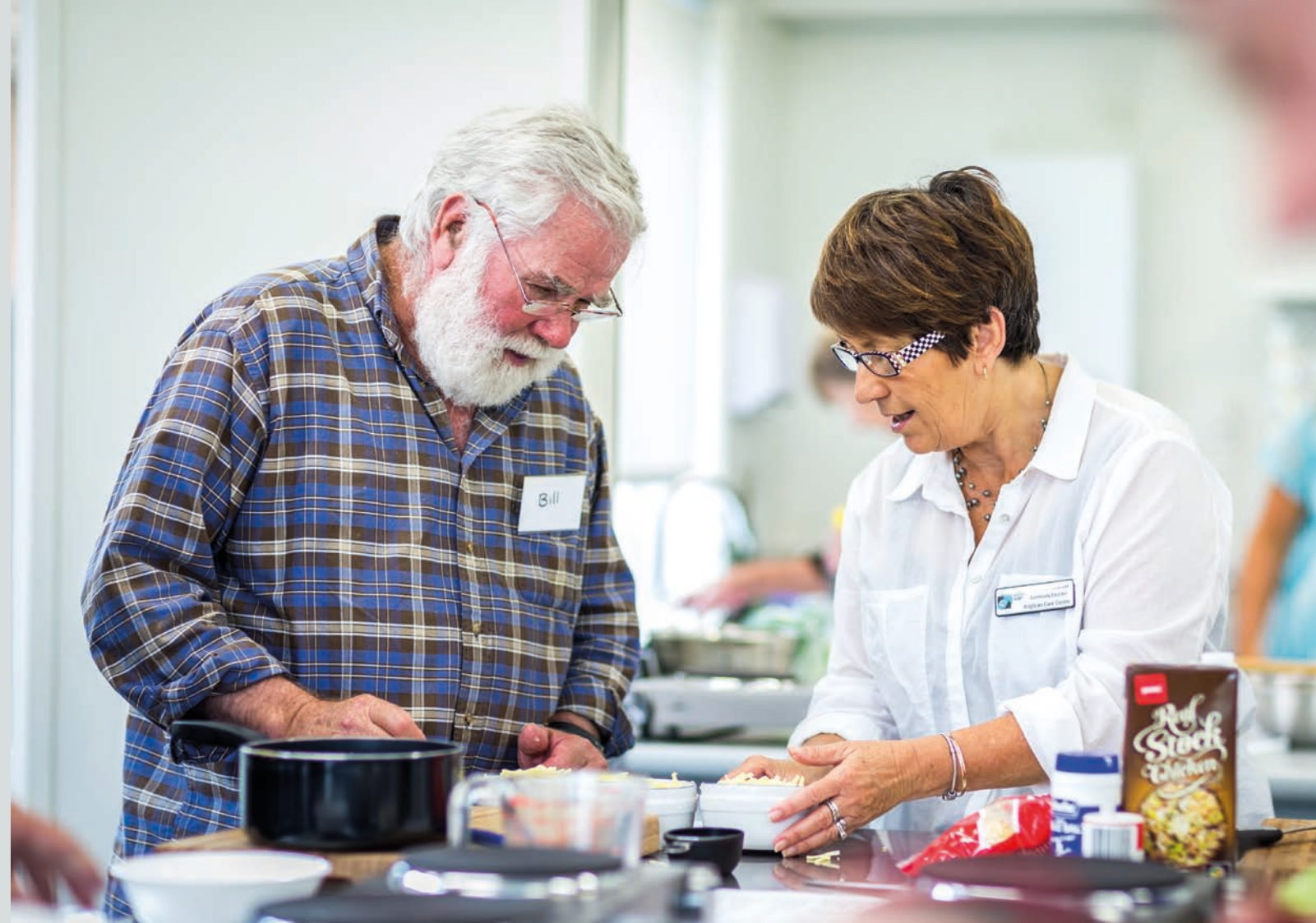
Cooking for one can be a challenge. The Selwyn Foundation has provided funding for practical cooking classes for older people living at home.

A Memorandum of Understanding has been signed with Auckland Council which will allow feasibility work and due diligence to be progressed, with the objective of entering a formal contract mid-year. This would allow services to commence in the second half of 2016.